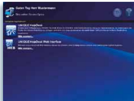
Selection of the application

At the client site there is only required an operating system (Win XP SP3 or higher) and your software has to be able to operate with a terminal server.